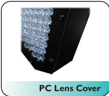
PC Lens Cover