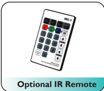
Optional IR Remote

As a DJ, small band or entertainer, the Lumicraft LumiStage-4x146/10 gets you up and running with a basic stage lighting system in minutes – just unfold a tripod, drop the LumiStage-4x146/10 on top, connect power and DMX cables and you are ready to rock! Using 10mm ultra-bright LEDs in its 4 RGB LED panels, the LumiStage-4x146/10 delivers enough light output for small venues, while the performer and the audience remain unmolested from heat or noise as the unit does not create any noticeable heat and does not require noisy cooling fans. Unlike other systems which lack suitable and user-friendly control systems, this unit has been designed to work either with the LumiCon-43 handheld DMX controller, or the LumiCon-43/F foot-operated DMX controller, or the IRC-1 infrared remote control (all optional - none included). Being delivered in a handy gigbag for easy transport, this is your perfect lighting companion!